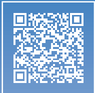
Undergraduate Application Form

You may scan the QR codes below to download the relevant forms.