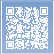
Bursary Application Form