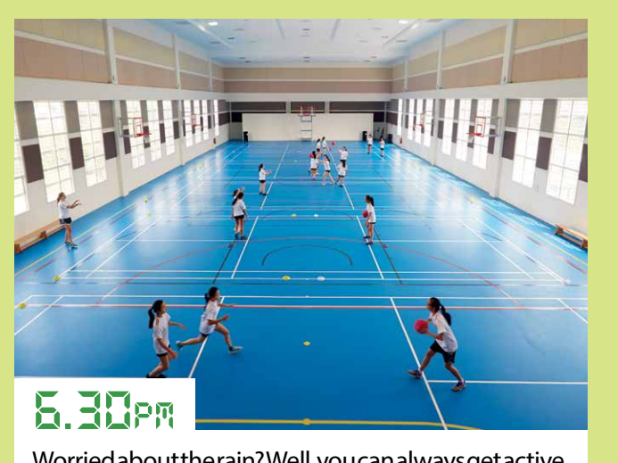
Worried about the rain? Well, you can always get active with some sporting activities in our indoor hall.