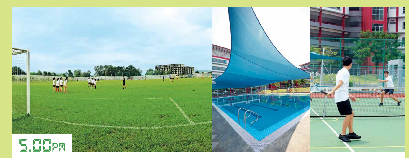
Take a dip in the swimming pool or break a sweat in the football field or tennis court.