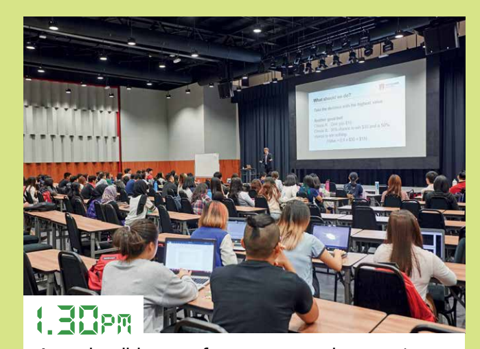
Attendatalk by one of our many guest lecturers in our spacious multi-purpose hall.