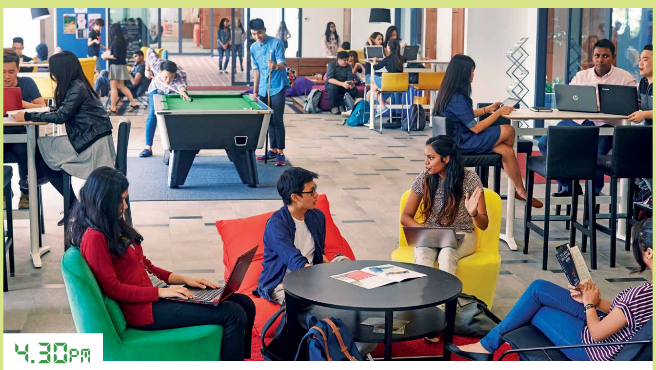
Take a break and challenge your friends to a game of pool or hang out in the spacious student lounge.