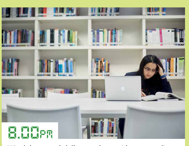
Wind down and chill or catch up with your studies before the library closes at 9.30pm.