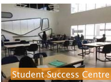
Student Success Centre