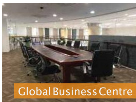
Global Business Centre