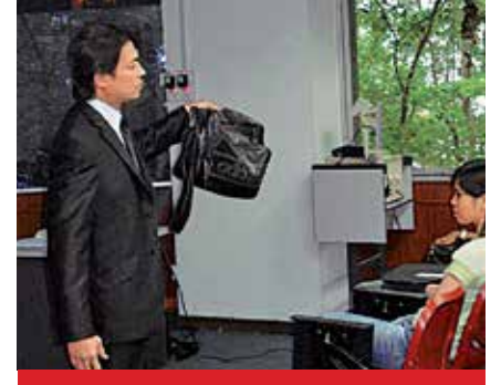
SENIOR MEMBERS OF THE LEGAL PROFESSION GIVE GUEST LECTURES THAT ENHANCE STUDENTS' KNOWLEDGE OF THE LAW.