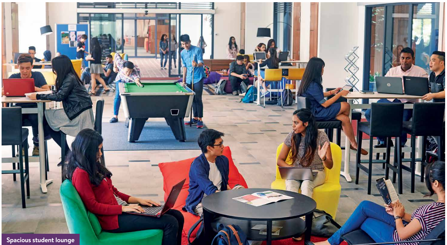
Spacious student lounge