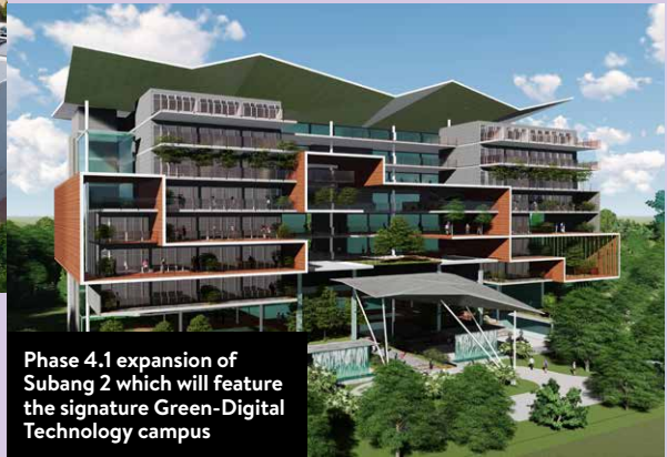
Phase 4.1 expansion of Subang 2 which will feature the signature Green-Digital Technology campus