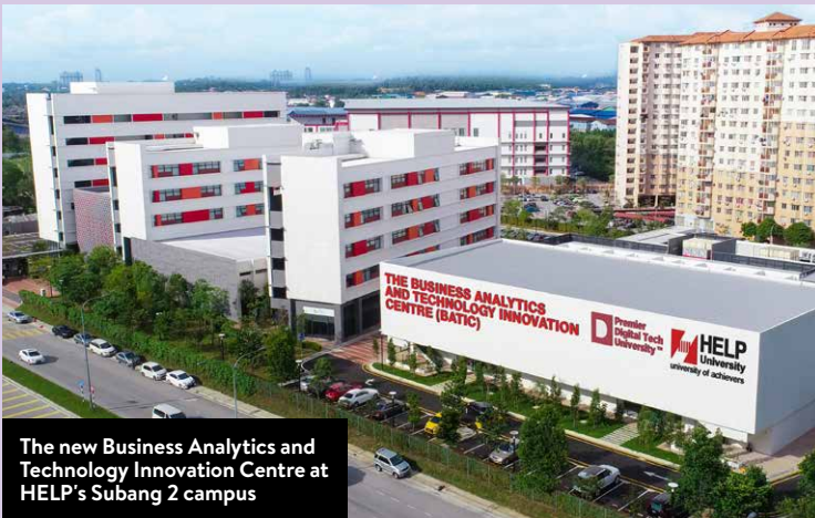
The new Business Analytics and Technology Innovation Centre at HELP's Subang 2 campus