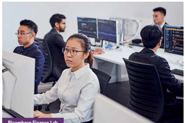
Bloomberg Finance Lab

“Our business students can also get certified in Bloomberg Market Concepts (BMC) using the Bloomberg terminals. Such training and access to rich data, case studies, information resources and financial tools will accelerate our students to become global leaders in the financial and business world.”